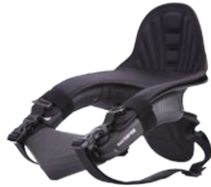
360 Plus Device neck collar (optional)