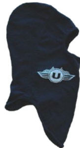
Unser Racing headsock

Experience incredible speed, g-force, and handling in our BRAND NEW Sodi GT5 gas-powered karts!